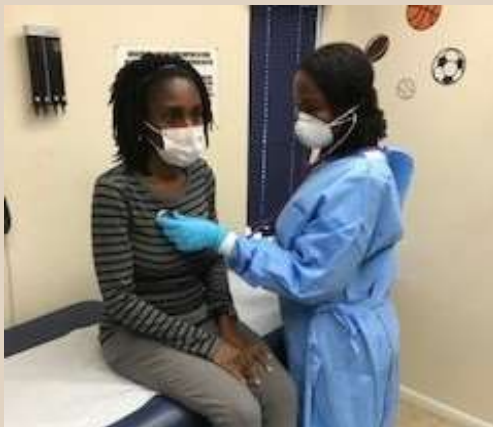
Clinic patient given an exam.

Pediatrics General Medicine Dental Obstetrics & Gynecology Nutrition Nurse Family Partnership DCF Access Point