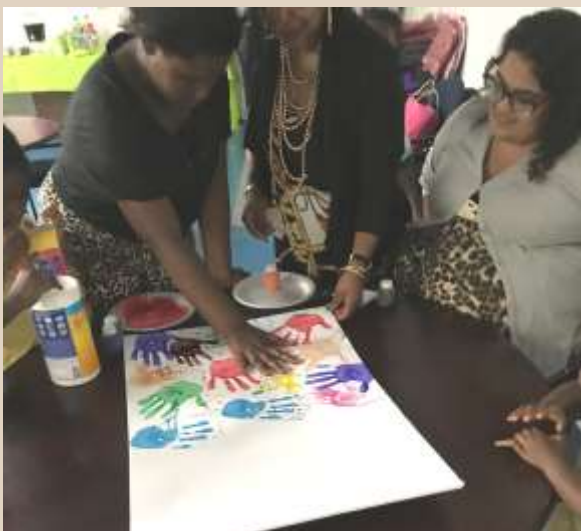
Clients prepare thank you card for corporate donors.

Many of the families received their services virtually during the COVID-19 pandemic. Program events included: a Back to School book bag drive-thru, Thanksgiving turkey box giveaway and a Christmas Toy drive.