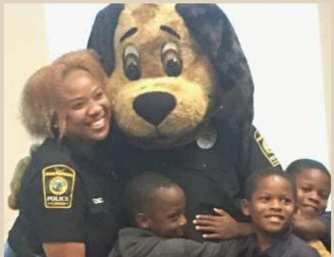
S.N.A.P visits the Miami Gardens Police Department