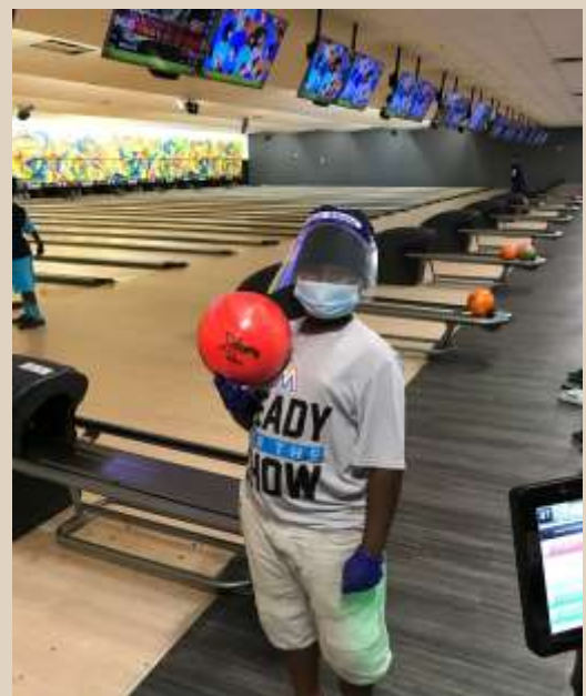
Freedom School camp is fun and educational!