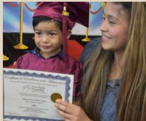
Nurse Family Partnership Program Graduate