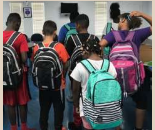
Children from CFCE receive backpacks

Foster Care Adoption Emergency Shelters Safety Management