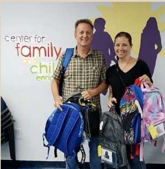
Friends of CFCE donate to the back to school drive.

Behavioral Health continues to work remotely during the Pandemic, delivering quality telehealth services for individuals and groups.